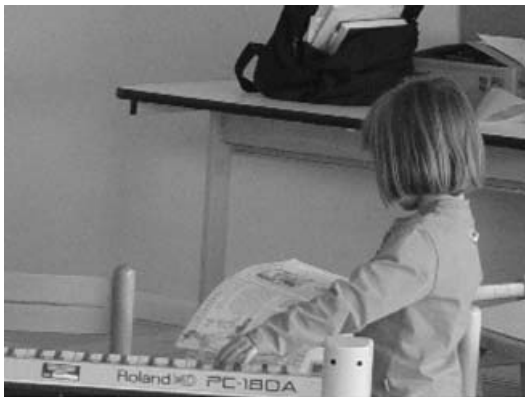
Fig. 2a Narrator, player, listener

Of particular interest are the relationships established between the two children when playing together, and between them and the system: playing, listening, exploring together, watching the partner's reactions, playing separately, alternating, or conflicting (Fig. 2b). A typical situation encountered was the phenomenon of 'joint attention': more precisely, one of the children would force the other to stop playing in order to listen to the situation. We call this situation 'Aspetta' (the Italian word for 'wait') (Fig. 2c).