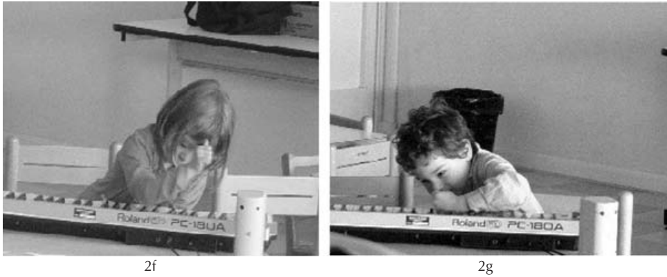
Fig. 2f Exploring the machine with her elbow...; Fig. 2g ... and with his fist