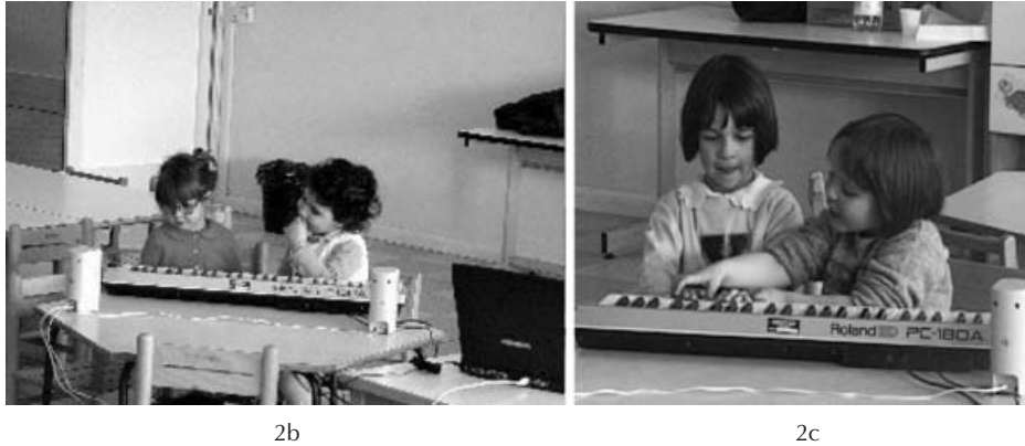
Fig. 2b They listen to the keyboard as it answers, and share their perplexity; Fig. 2c Joint attention – ‘Aspetta’: one girl stops her friend in order to listen to the machine