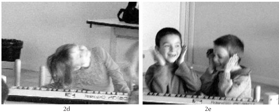
Fig. 2d Listening and ecstasy; Fig. 2e Listening to the Continuator